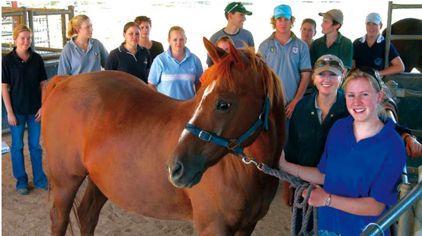
CSU students have excellent opportunities to develop their horse skills at the CSU Equine Centre

R ural and regional communities in Australia continue to face a potentially devastating shortage of experienced veterinary practitioners. Charles Sturt University's (CSU) Veterinary Science program is undertaking a different approach to veterinary education in order to combat this ongoing problem.