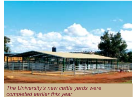
The University's new cattle yards were completed earlier this year

Stage 2 includes the construction of the Clinical Training Centre which will be used primarily for the clinical training of students with horses and small