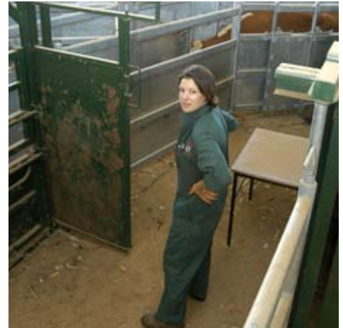
The new cattle yards offer outstanding opportunities for CSU students to develop strong cattle skills in a modern, safe and efficient environment.