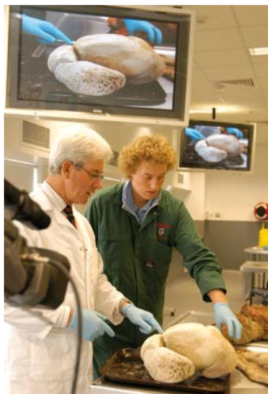
The Anatomy Laboratory in the recently opened Pre-Clinical Centre has outstanding digital teaching resources in addition to more conventional dissection and model-based instruction.

For further information, contact the School of Agriculture and Veterinary Science on (02) 6933 2760.