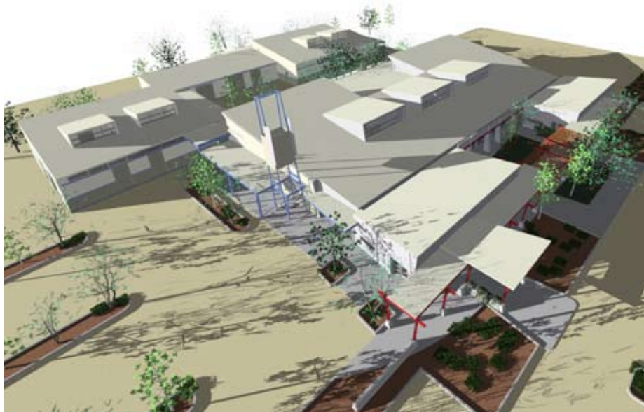
The Clinical Centre at CSU is designed for training in veterinary medicine, surgery, diagnostic imaging and animal reproduction.

To provide a high standard of training for veterinary science students, Charles Sturt University (CSU) has embarked on an extraordinary capital works program which will result in a series of first-class buildings and facilities on the Wagga Wagga campus.